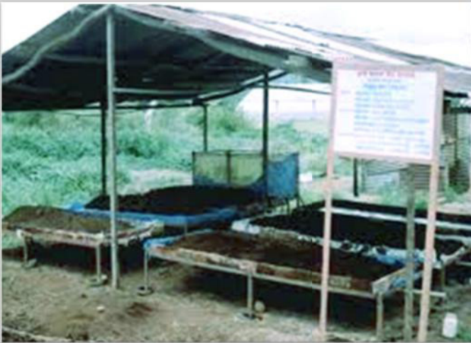
Kan.churi a.sal tariani