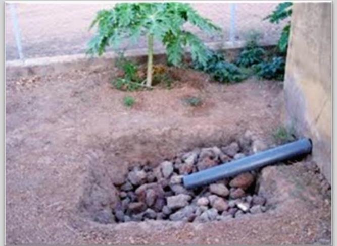
Songo –noko ringani chiko man.na kamka.ani: Chinapangani a.kolko kitani