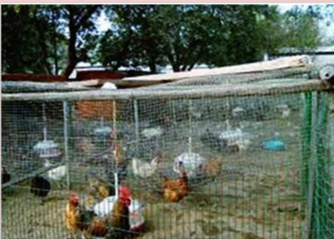
Jilla kaanio manchapgipa kam; Donol rikani