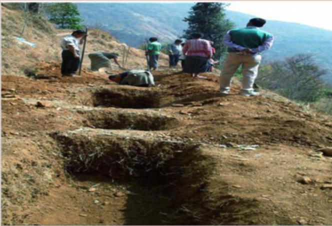
A.bri jolo water shade –o man.chapgipa kamrang