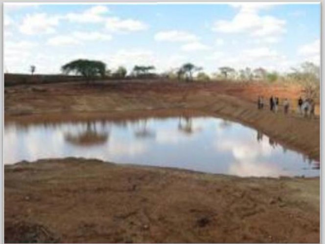
A.mang gatdoe band/dam kaani