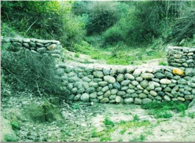
Ro.ongranko gatdoe a.mitimko chisol ra.e kataniko champengani