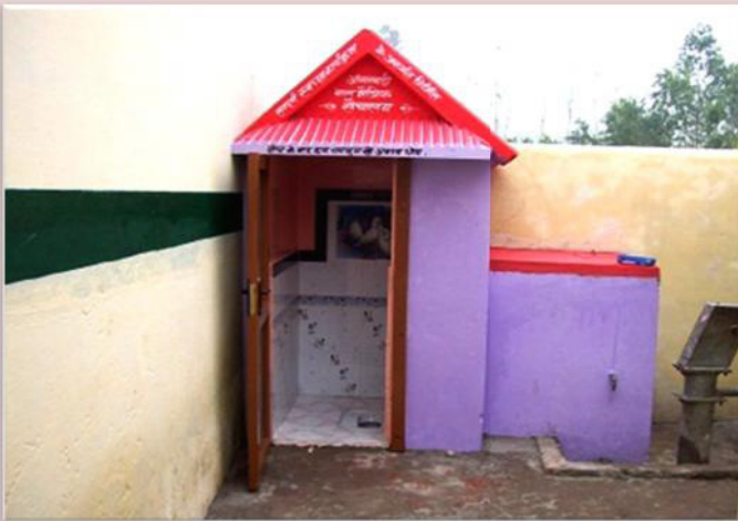
Songo-noko rongtal an.talani: Nokantio paikana rikani