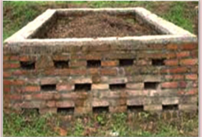
Ge.a – gamanio man.chapgipa kamrang; NADEP a.sal tariani