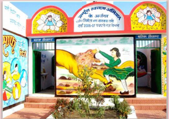
Skul-nokrango paikana rikani