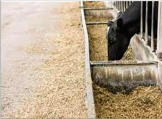
Matchunolni a.pako paka dakani, subu tengki rikani aro alchakram chikongko tariani