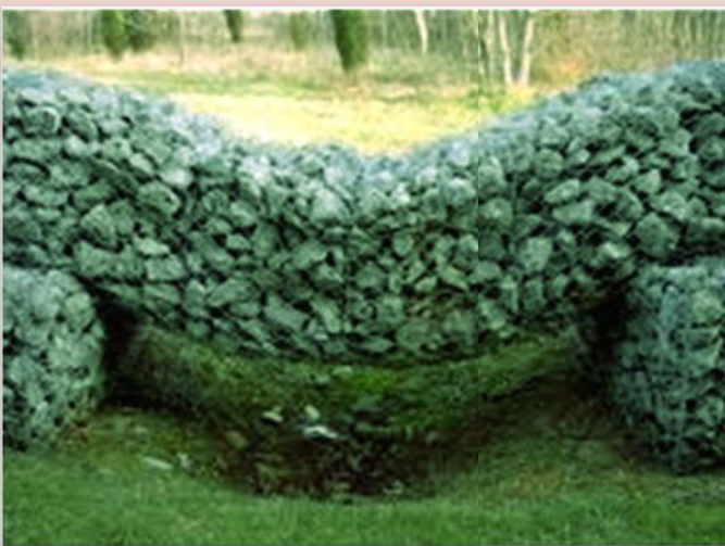
Gabion structures-ko rikani