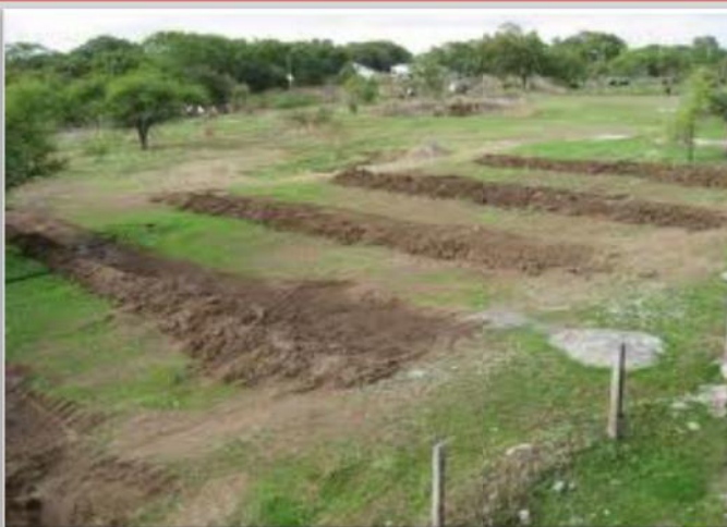
A.riking joljol nalakitani