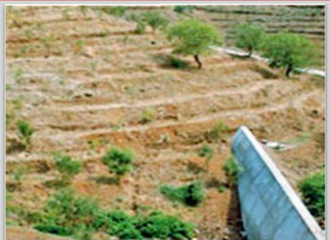
Ariking joljol ali gatani